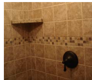
Low Flow-Faucets and durable ceramic tile