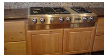
Custom Cabinetry, Energy Star® Appliances, Concrete Countertops and Recycled Glass Tiles

This home is located in a region where annual rainfall is approximately 8 inches, so conserving water is achieved indoors with low-flow toilets, showerheads and faucets. Outside, drought-tolerant landscaping features plants that are adapted to low precipitation, and pervious pavers allow the small amounts of water to infiltrate directly into the soil.